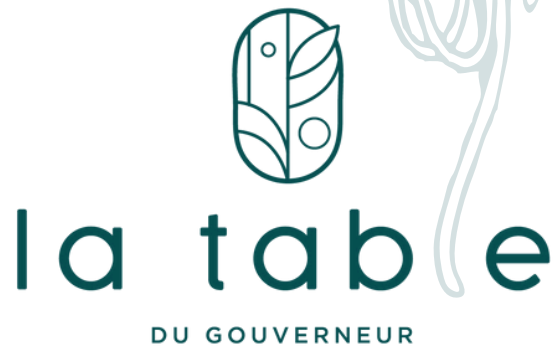
Table that Takes its Time

Each morning, we handcraft our fresh pasta , using organic semolina from Moulin Marion. Our focaccia rises gently, nurtured by natural sourdough.